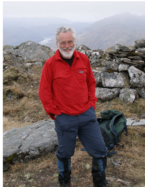
Top of Ben Aden – Sunday 4 th May 2006 – from Barrisdale – he raced me to the top, and won! Just me and him. Lovely day. FDHWC meet at the White House, Barrisdale, May 2006.