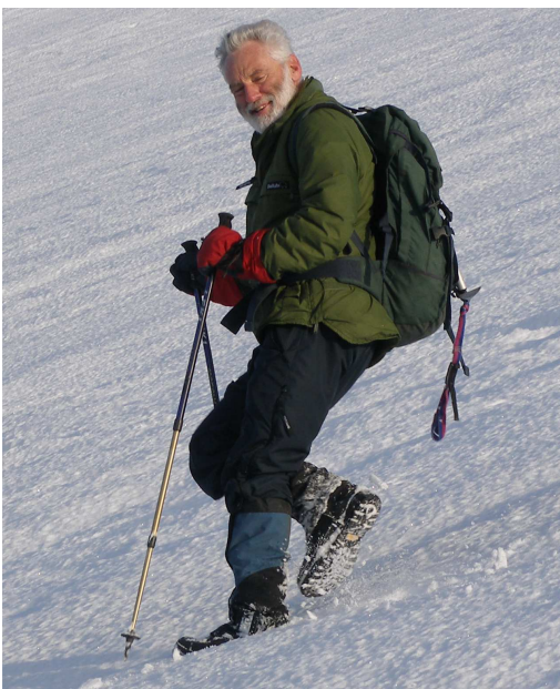
New Year meet 3 rd January 2005 – Glas Maol