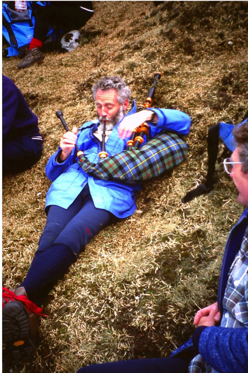
June 1992 - mastering the pipes (might have been taken at Barbara Redford's last Munro on Stobinian)